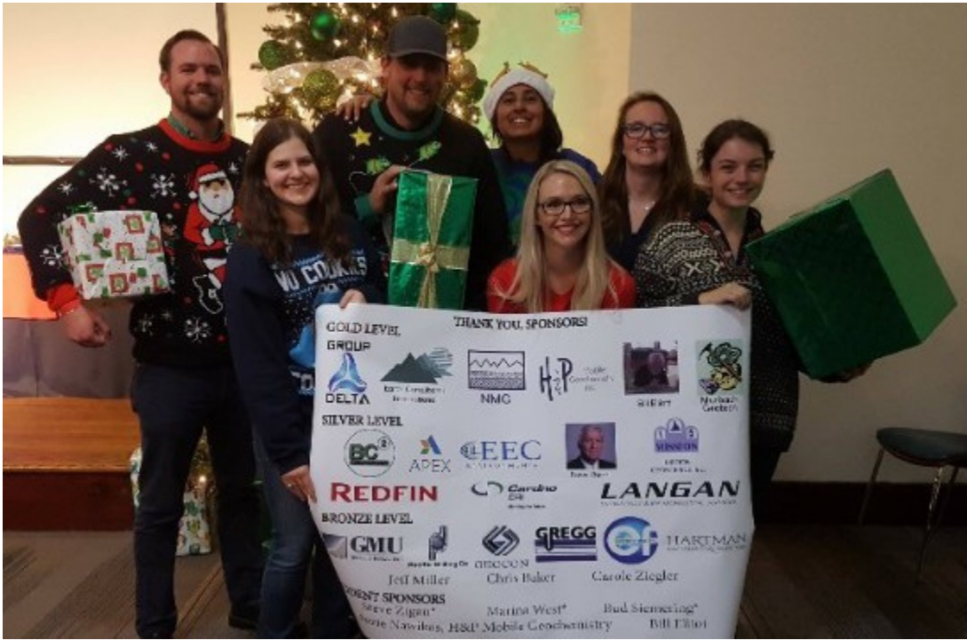
2017 Holiday Party and Benefit