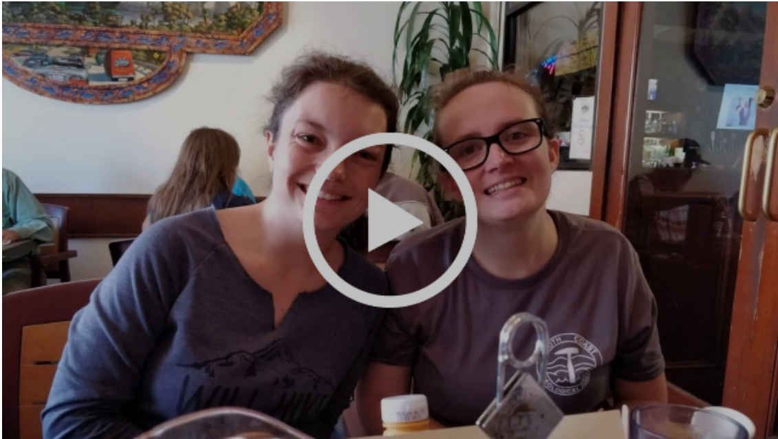
South Coast Geological Society Hike+Brew: Portuguese Bend Reserve