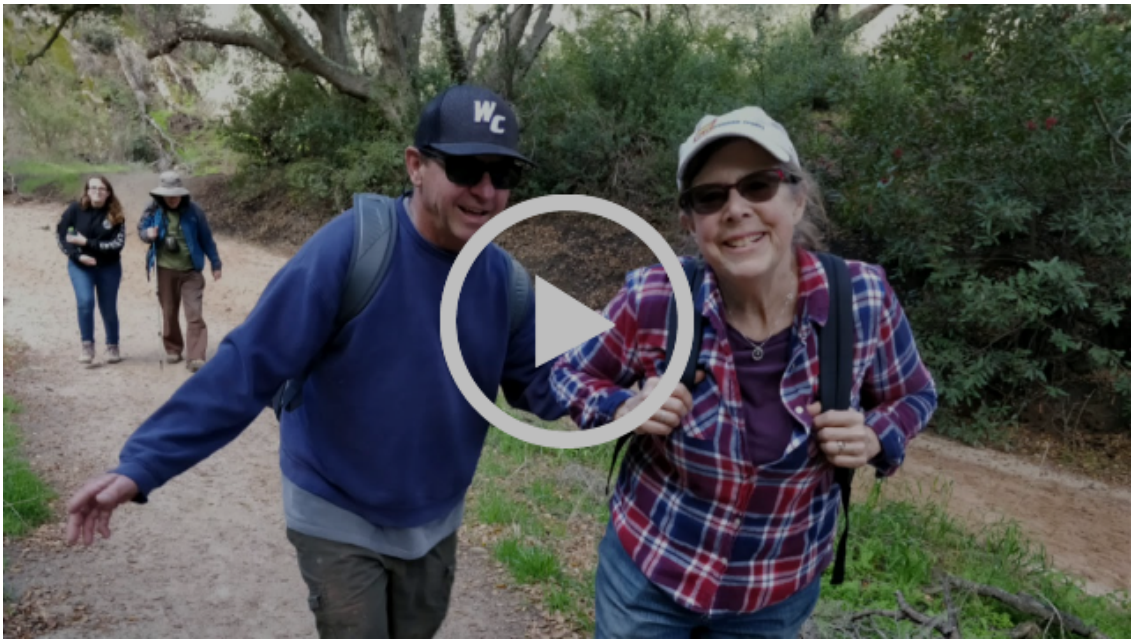
South Coast Geological Society Hike+Brew: Whiting Ranch Red Rock Canyon